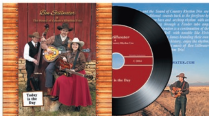
Albums / CD Covers